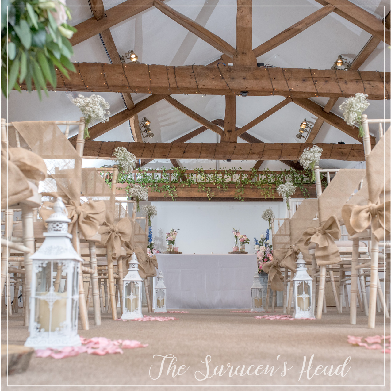
The Saracen's Head